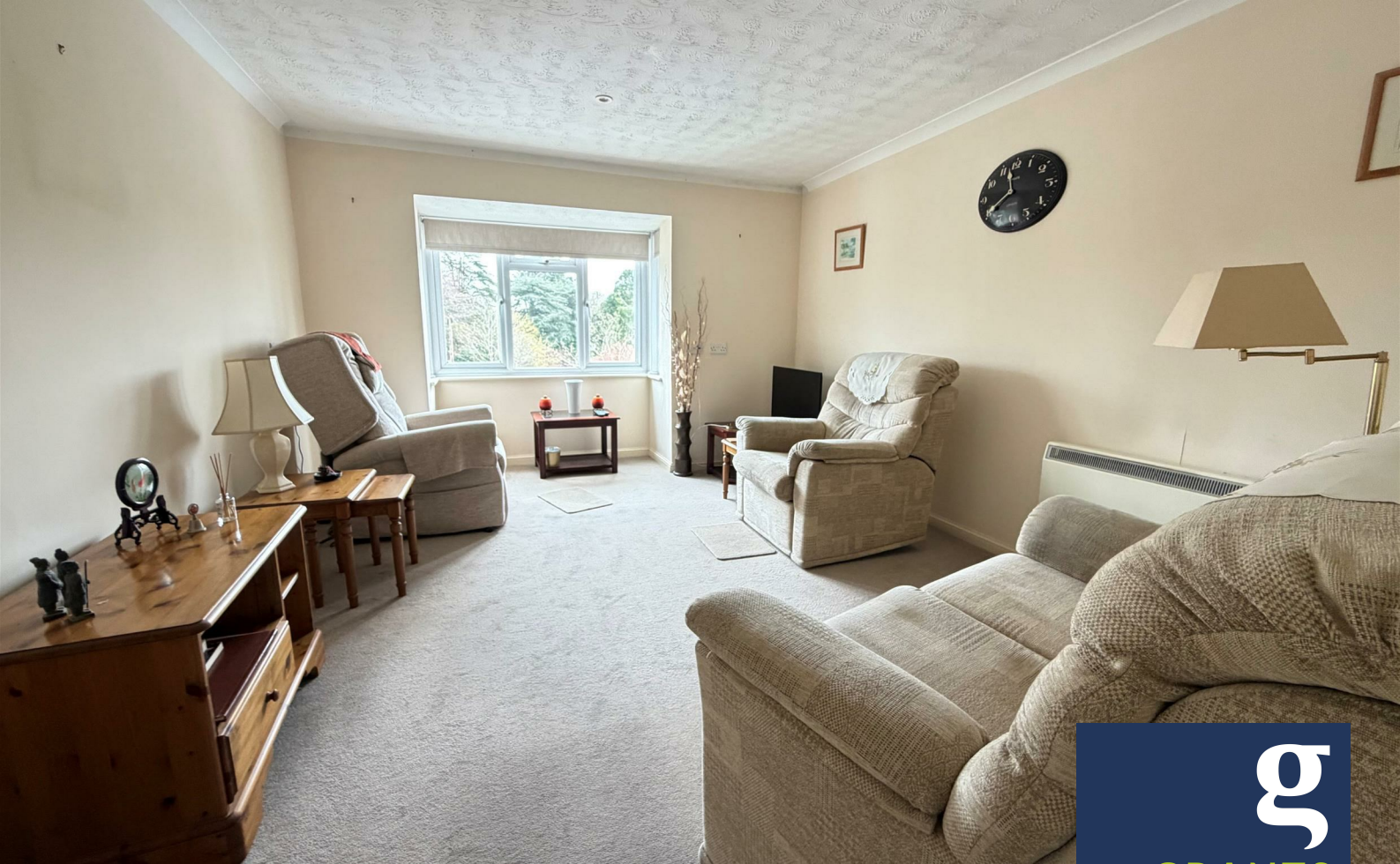
Crockford Park Road, Addlestone, KT15 2LQ